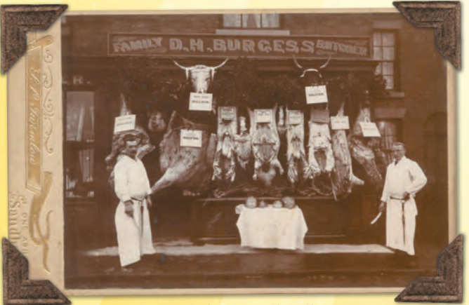
<mark>Isaac can be</mark> seen on the right

She remembered that, "there was always a kettle on the hob of the large kitchen fire range. The kitchen range was black, which was always kept very clean and regularly rubbed down with traditional black polish."