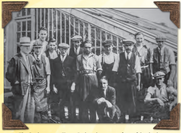
The Garden team at Tatton Park in the 1920s in front of the glasshouse