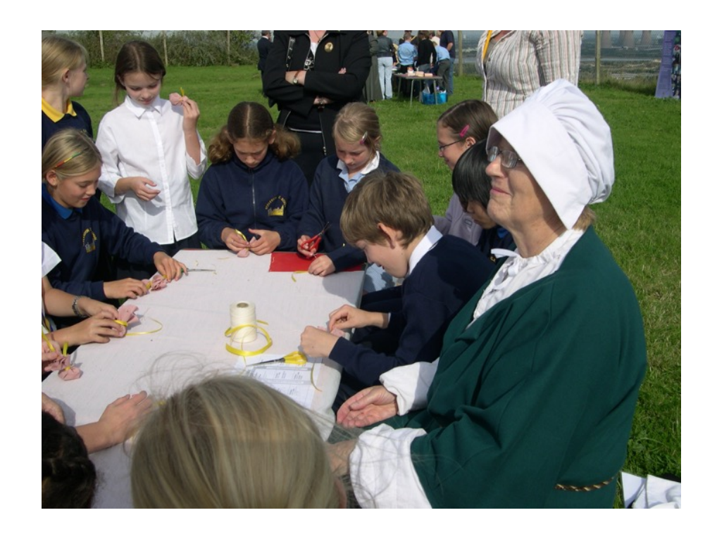
We all hope that you really enjoy your visit to Tatton Park.